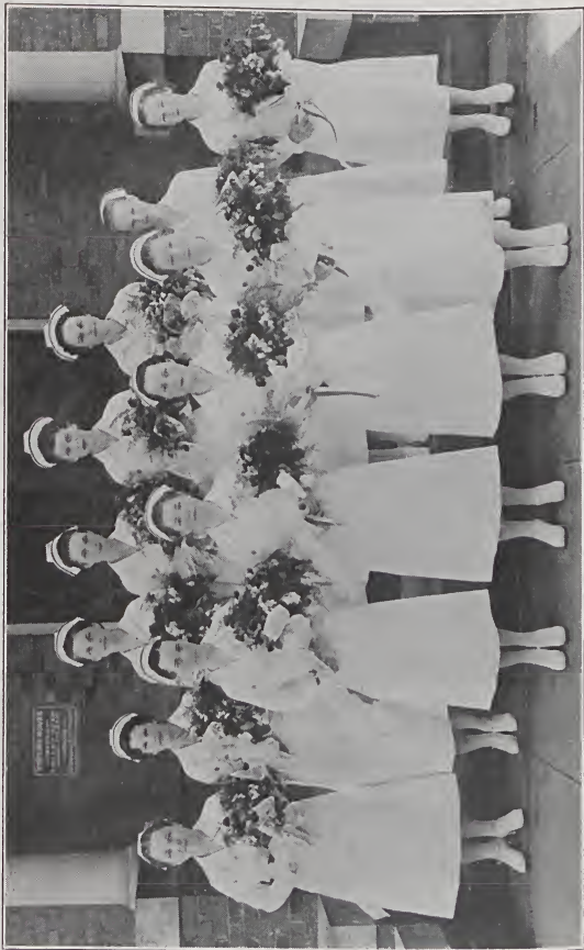
GRADUATION CLASS OF 1936