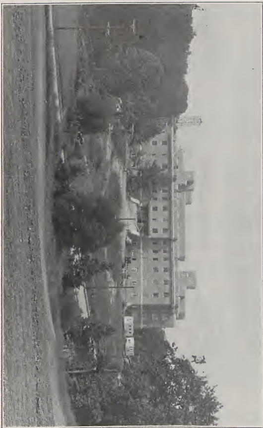
REX HOSPITAL UNDER CONSTRUCTION